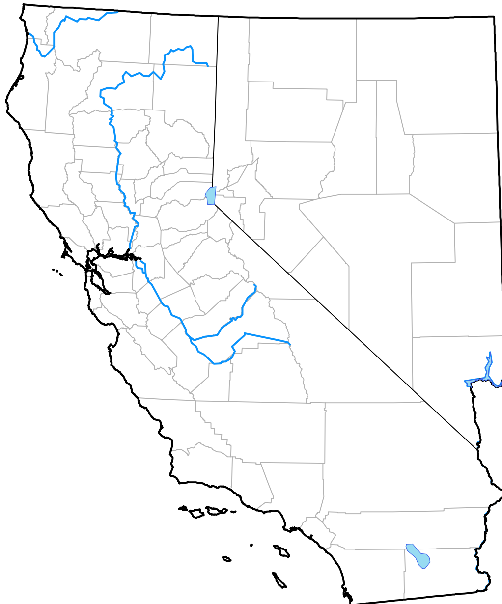
Drought Conditions (Percent Area)