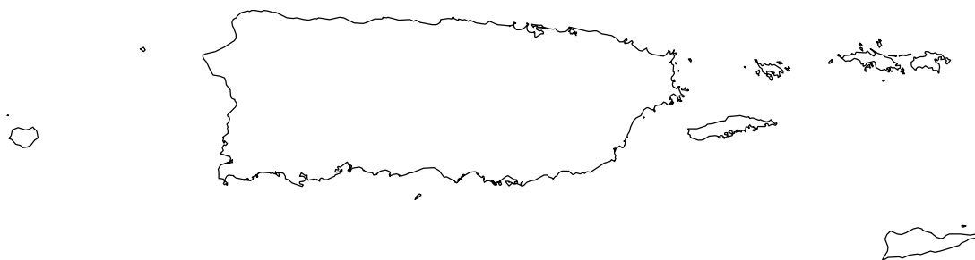
Drought Conditions (Percent Area)

December 13, 2011 (Released Thursday, Dec. 15, 2011) Valid 7 a.m. EST