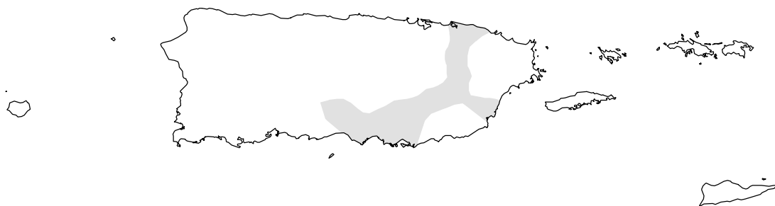
Drought Conditions (Percent Area)

October 23, 2012 (Released Thursday, Oct. 25, 2012) Valid 8 a.m. EDT