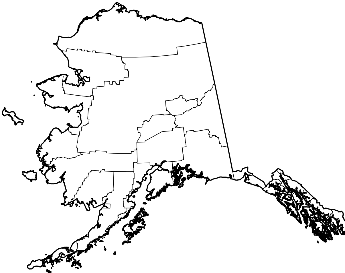
Drought Conditions (Percent Area)

August 26, 2014 (Released Thursday, Aug. 28, 2014) Valid 8 a.m. EDT