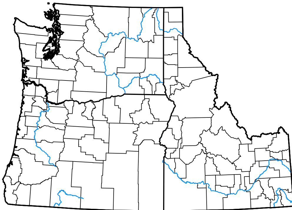
Drought Conditions (Percent Area)

May 30, 2017 (Released Thursday, Jun. 1, 2017) Valid 8 a.m. EDT