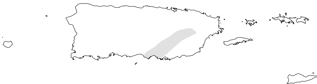
Drought Conditions (Percent Area)

September 4, 2007 (Released Thursday, Sep. 6, 2007) Valid 8 a.m. EDT