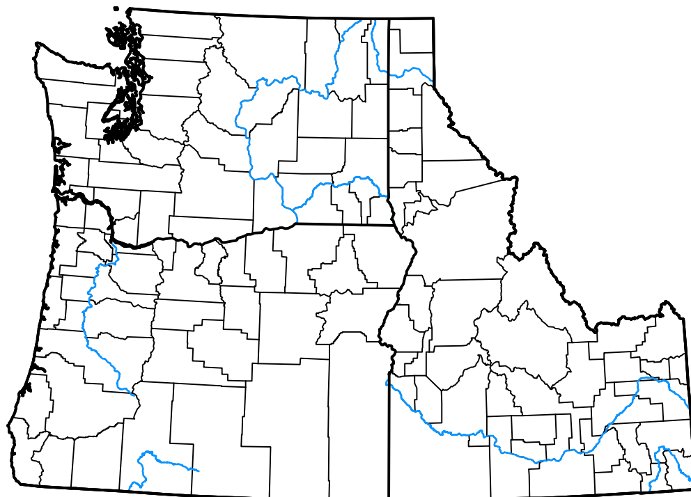
Drought Conditions (Percent Area)

April 4, 2017 (Released Thursday, Apr. 6, 2017) Valid 8 a.m. EDT