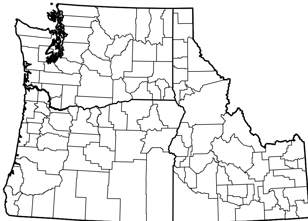
Drought Conditions (Percent Area)

May 9, 2017 (Released Thursday, May. 11, 2017) Valid 8 a.m. EDT