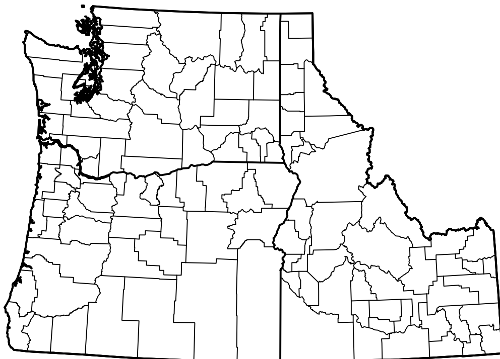
Drought Conditions (Percent Area)

June 6, 2017 (Released Thursday, Jun. 8, 2017) Valid 8 a.m. EDT