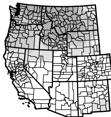
Drought Conditions (Percent Area)