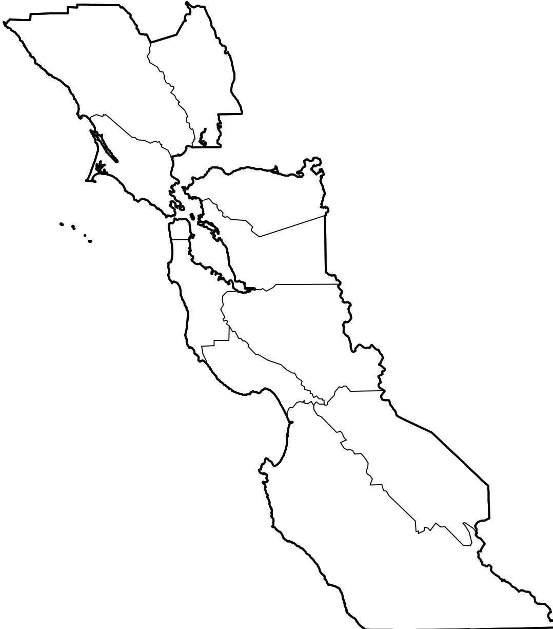
Drought Conditions (Percent Area)

January 31, 2006 (Released Thursday, Feb. 2, 2006) Valid 7 a.m. EST