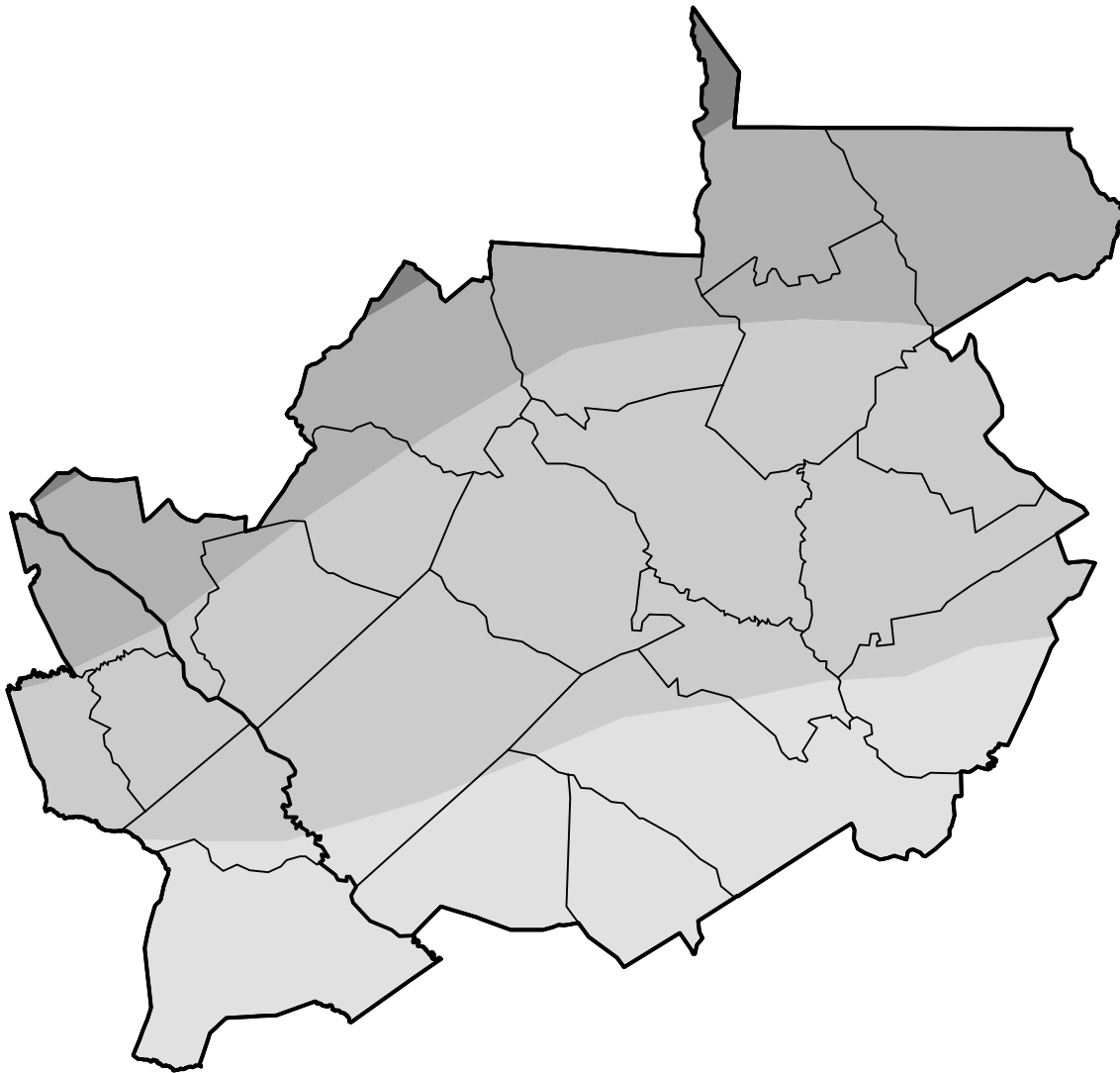
Drought Conditions (Percent Area)

March 11, 2008 (Released Thursday, Mar. 13, 2008) Valid 8 a.m. EDT