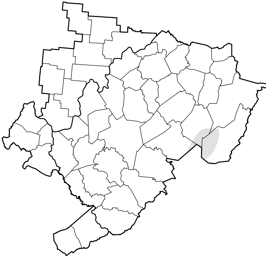
Drought Conditions (Percent Area)

October 4, 2011 (Released Thursday, Oct. 6, 2011) Valid 8 a.m. EDT