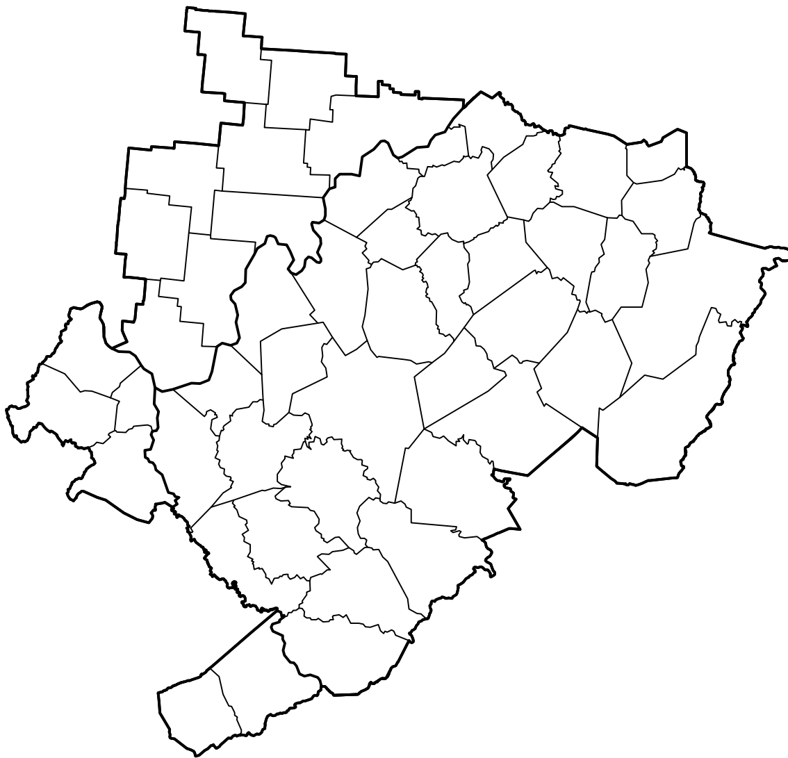
Drought Conditions (Percent Area)

August 21, 2018 (Released Thursday, Aug. 23, 2018) Valid 8 a.m. EDT