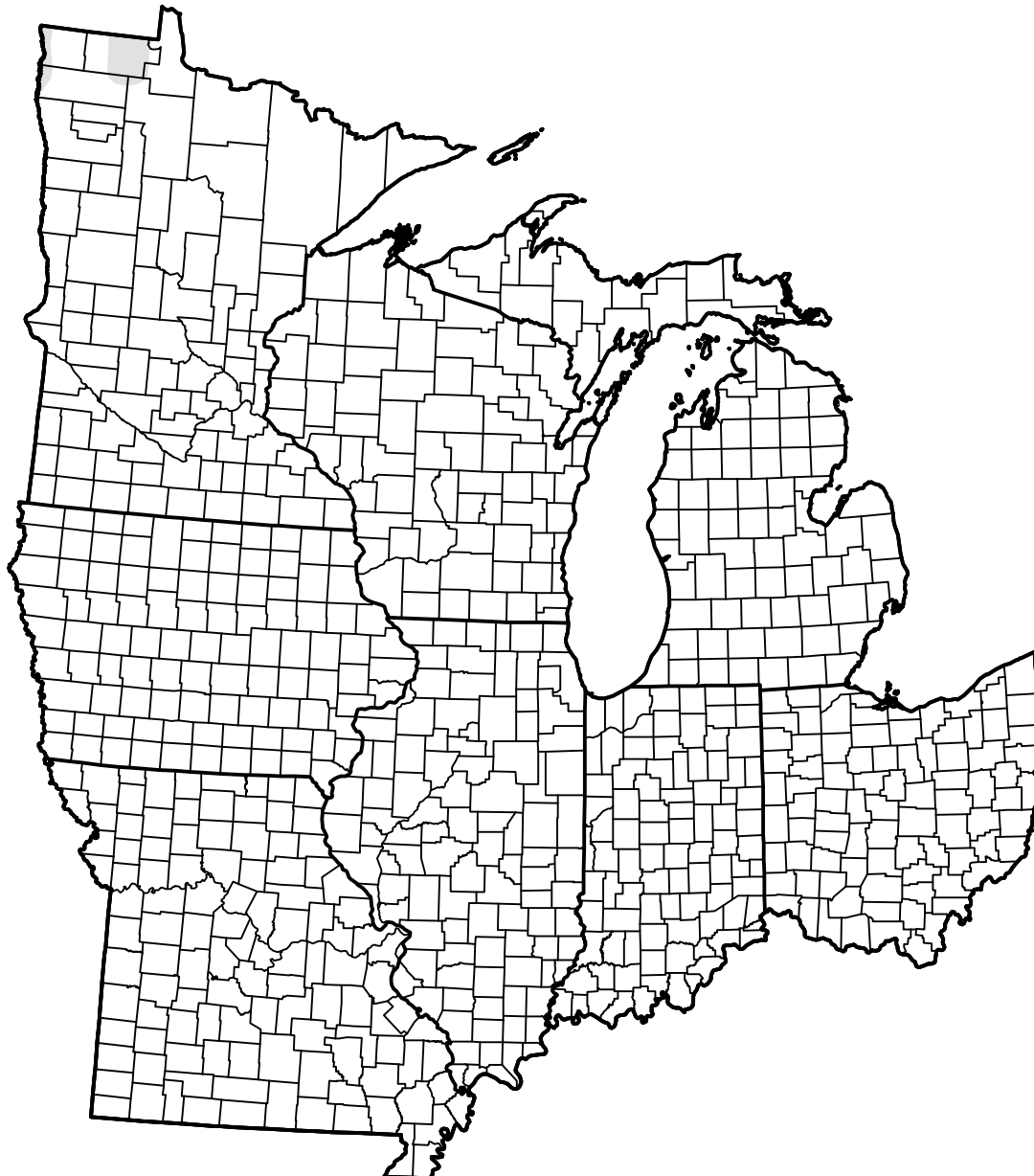
Drought Conditions (Percent Area)

January 15, 2019 (Released Thursday, Jan. 17, 2019) Valid 7 a.m. EST