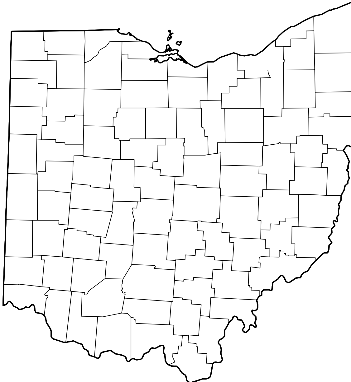
Drought Conditions (Percent Area)