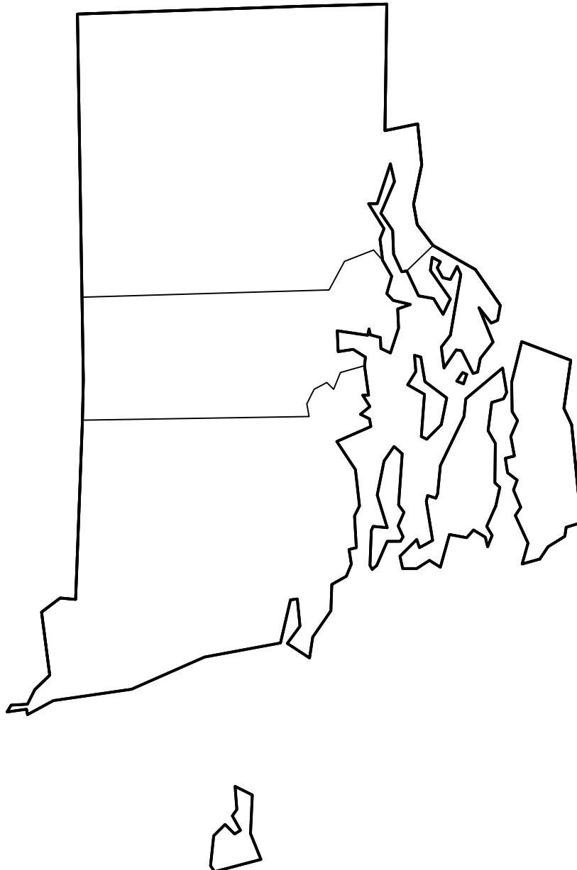
Drought Conditions (Percent Area)

March 9, 2021 (Released Thursday, Mar. 11, 2021) Valid 7 a.m. EST