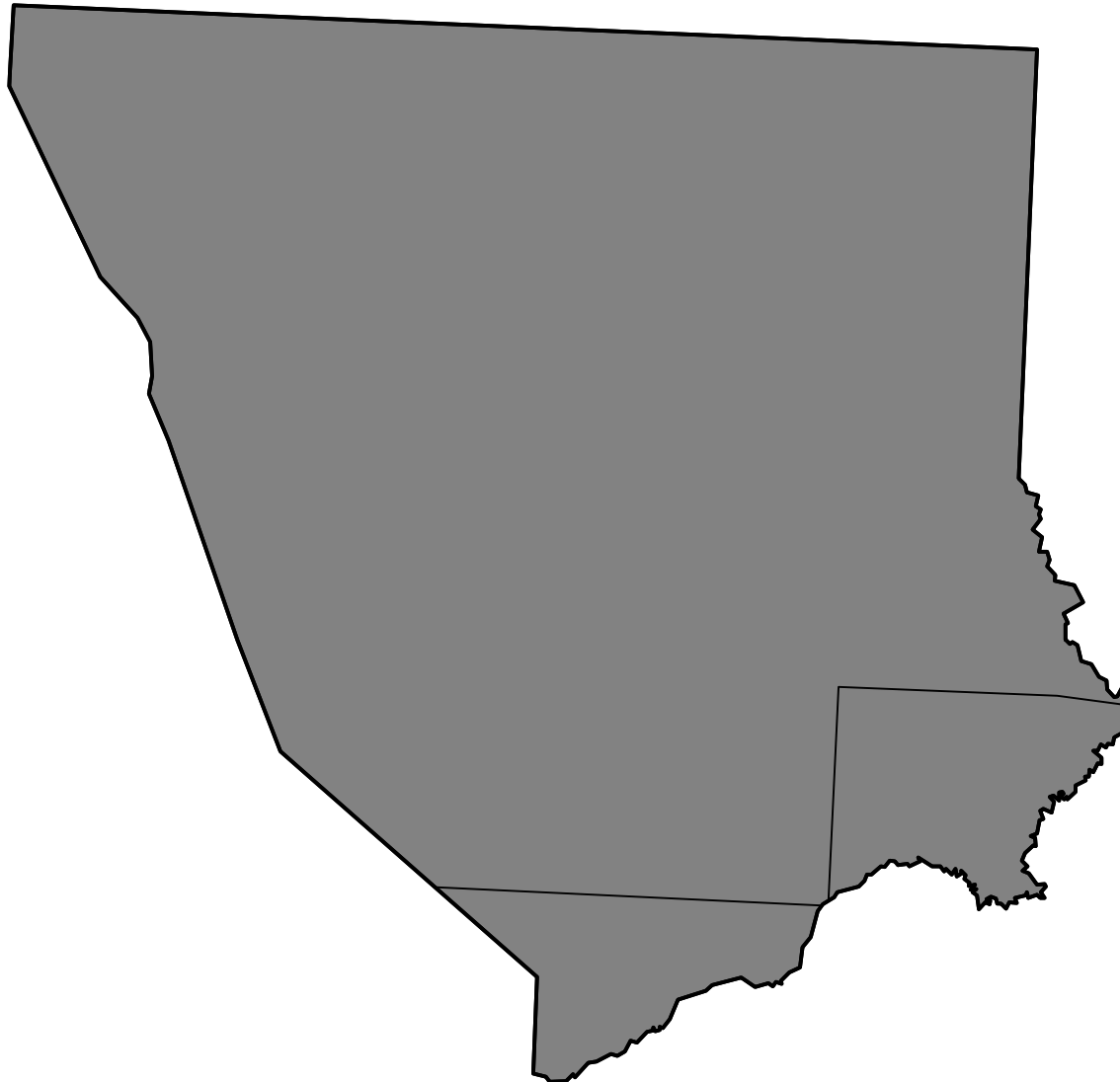
Drought Conditions (Percent Area)

October 19, 2021 (Released Thursday, Oct. 21, 2021) Valid 8 a.m. EDT